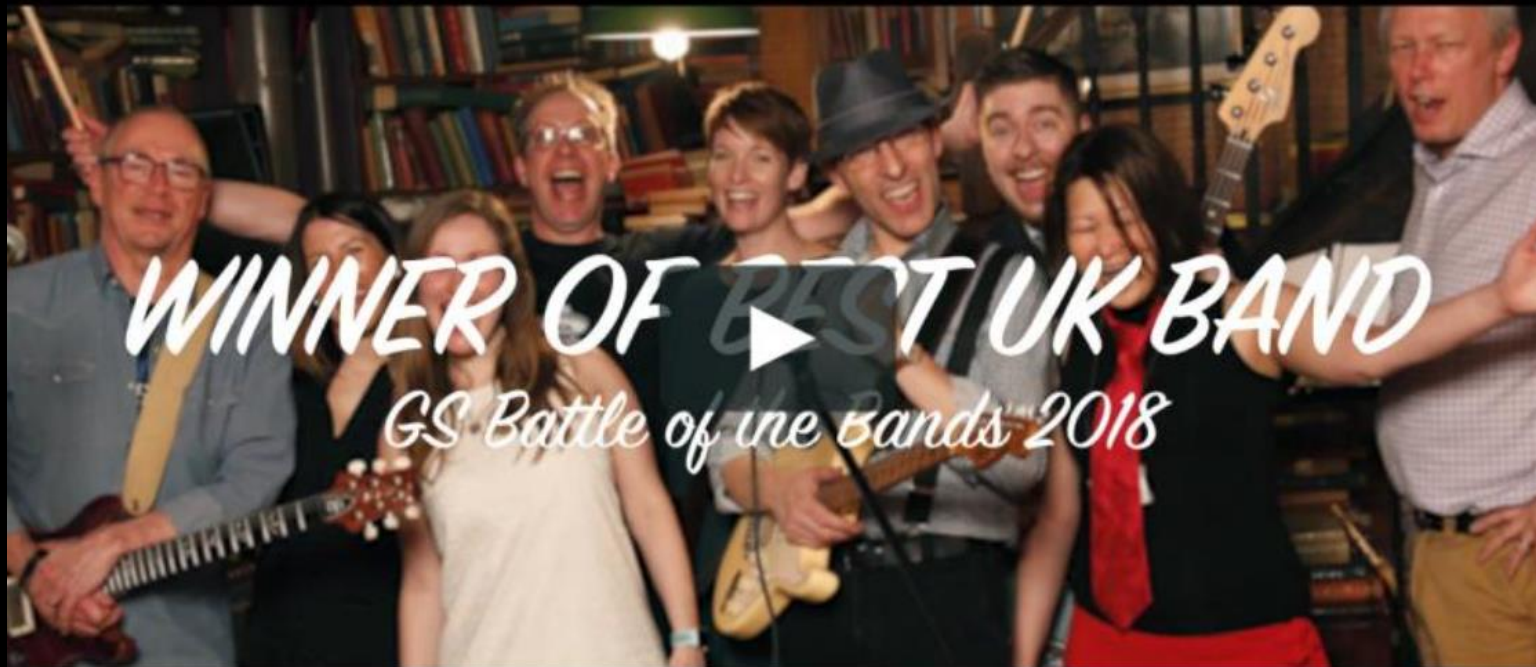
Change Bandits - Winners Video