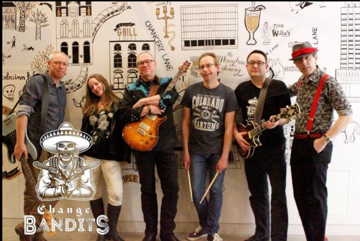
Change Bandits – The Making of “Behind the Scenes”